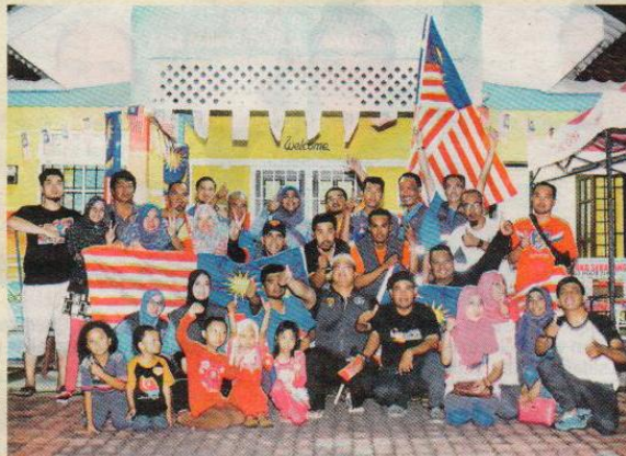
AJK sambutan gembira berjaya melaksanakan program melibatkan ramai masyarakat Taman Pulau Indah.

Beliau mengucapkan penghargaan kepada Ketua Balai Polis Kangkar Pulau, Pengerusi Jawatankuasa Penduduk, Ahli Majlis MPJBT, dan kedua-dua surau di kawasan itu atas kerjasama dan sumbangan diberikan.